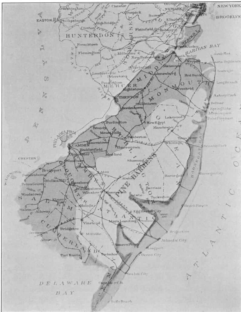
FIG. 1. Map of southern New Jersey. The unshaded area is all pine-barren; the shaded areas are not pine-barrens. Note the shaded areas along the coast and at Cape May.

possible.” 2 Notwithstanding this assertion it is the belief of the writer that not only is such correlation possible, but that, in the end, it is doubtful if there be any explanation, other than a